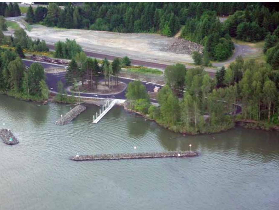
The new Wyeth Treaty Fishing Access Site.

This year, after intense education and pressure from the tribes, the State of Oregon increased its water quality standards to reflect the prominent role fish plays in the tribal diet. The study used as a basis for this change was conducted by CRITFC almost 15 years ago. Prior to this change, Oregon based its water quality standard on people eating only an ounce or two of fish a day. People eating more than this, a large number being tribal members, were potentially exposed to higher amounts of contaminants. The increase standard is now the strictest in the nation and protects all Oregonians, even those who eat salmon every day.